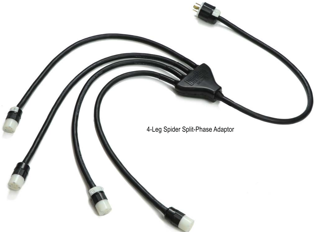
4-Leg Spider Split-Phase Adaptor

The Generator Cables and Accessories are suited to several industries and personal use: storm generators, construction sites, highway road work locations can benefit from our systems! All assemblies are made with 600v SOOW cable, and are tested to ensure the highest quality. Contact our sales team today, and remember; plug us in for safety!