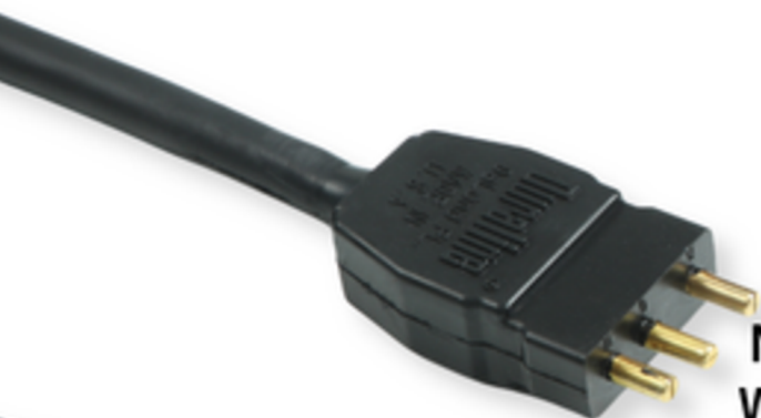
Nema 4 Rated Weather-Proof