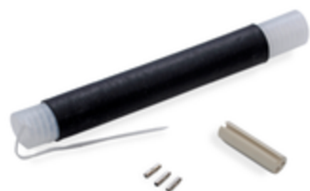
Cold-Shrink Splice Kit

Duraline Molded Stage Pin Extensions and Adaptors are available in any desired length, and are integrally molded in solid UV stabilized and flame retardant rubber. These extensions are available for both the 20 amp and the 60 amp Stage-Pin Connectors. Our adaptors allow connections between the Stage-Pin Connector and a NEMA 5-15 Connector. They are available in either a standard configuration or with the weather-proof connectors.