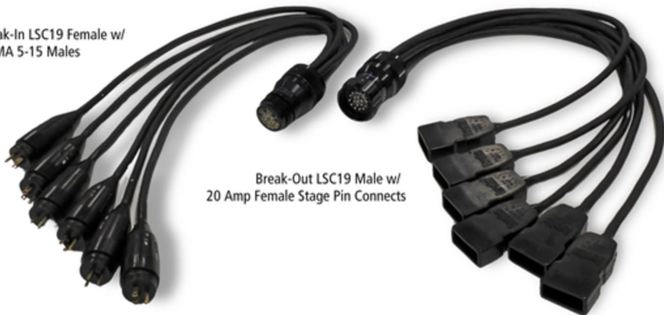
Break-Out LSC19 Male w/ 20 Amp Female Stage Pin Connects